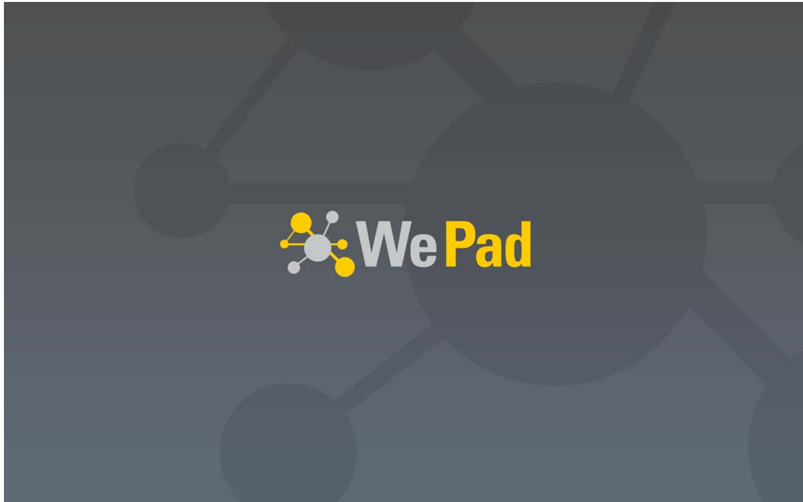
WePad desktop background