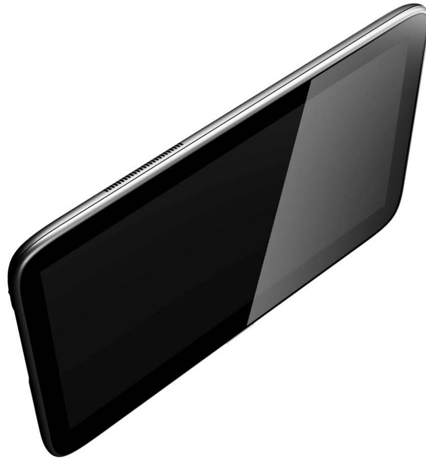
WePad view, slightly tilted to the front