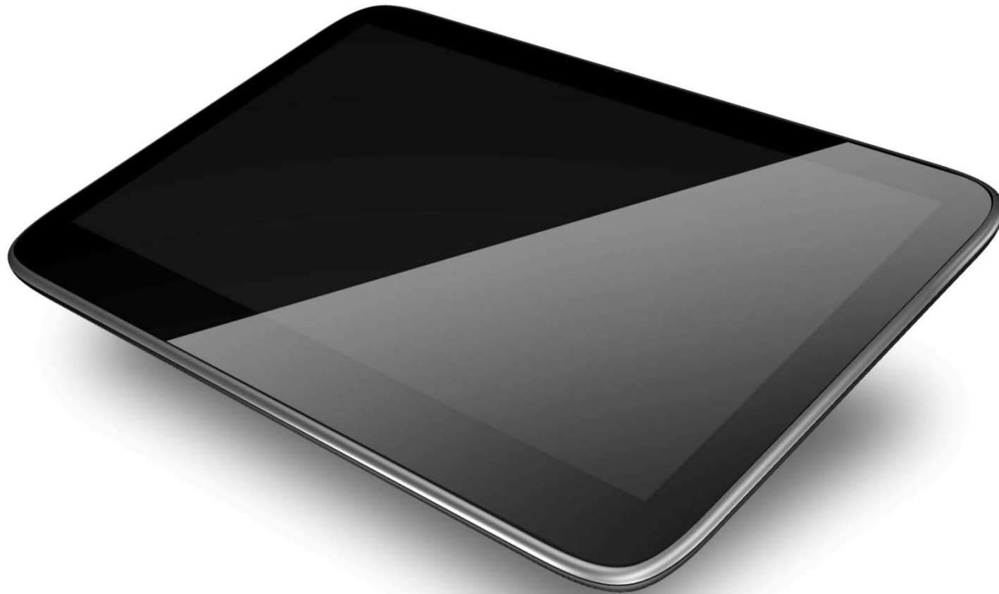
WePad frontal view, slightly tilted