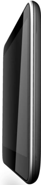
WePad side view