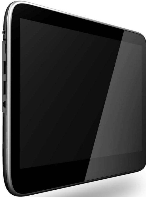
WePad view, slightly tilted to the right