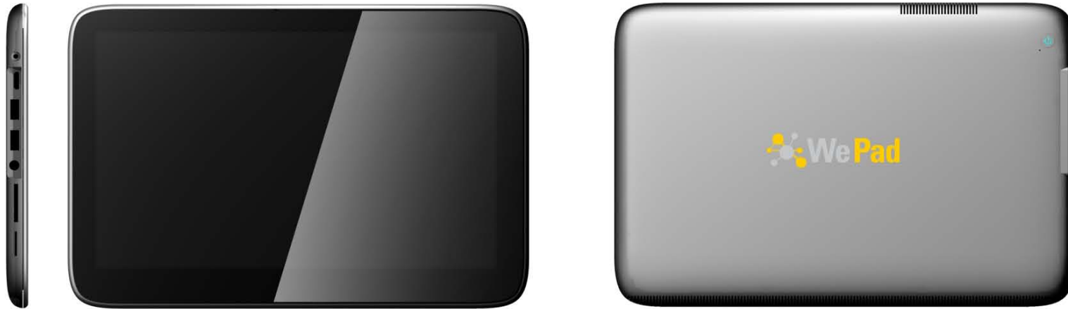
WePad side view, frontal view and view from behind