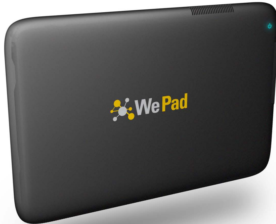
WePad view from behind