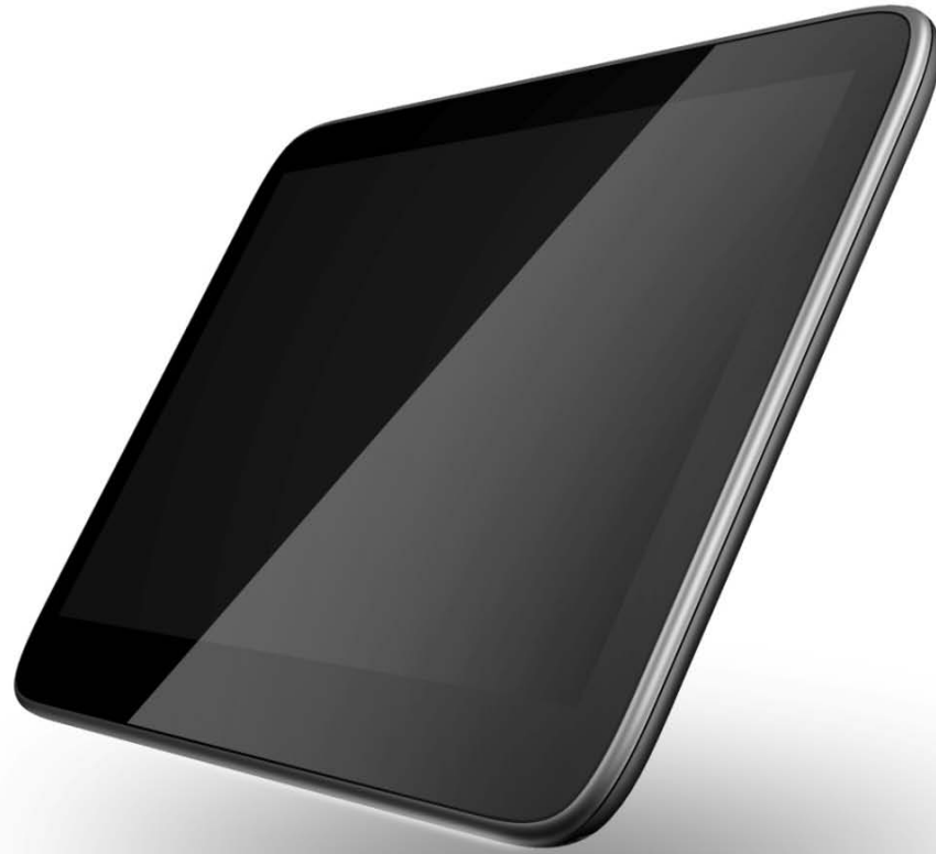
WePad view slightly tilted to the left