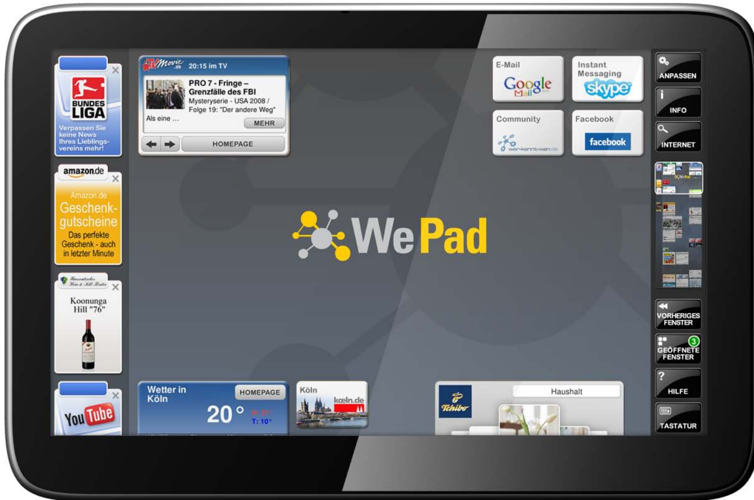
WePad desktop screen