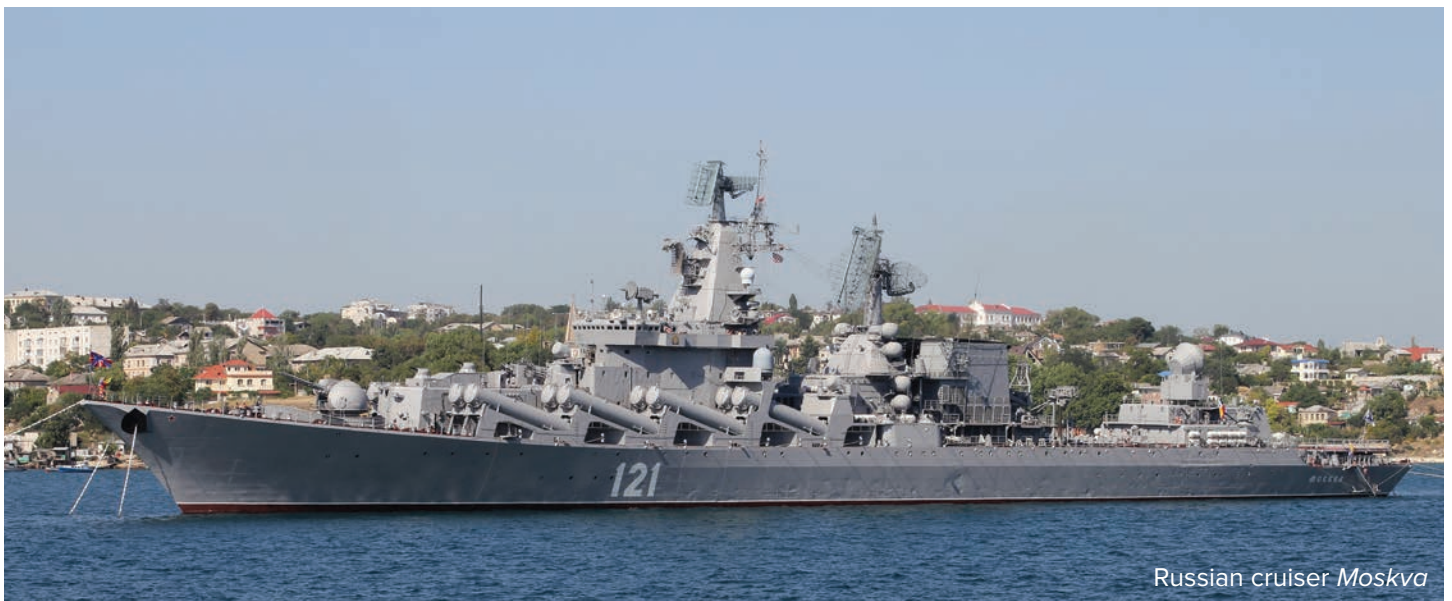
Russian cruiser Moskva

The Black Sea Fleet is incorporated into Russia's Southern Military District, which consists of the former North Caucasus military district, the Caspian flotilla, the 4th Air Force and Air Defense Command and the Black Sea Fleet. Since the collapse of the Soviet Union, the Black Sea Fleet has been a mainly "green water fleet" with limited high-seas capabilities. 3 It operates one guided missile cruiser, the Moskva , one classic submarine, three frigates, seven large landing ships, and several small antisubmarine warfare boats and small missile or artillery boats.