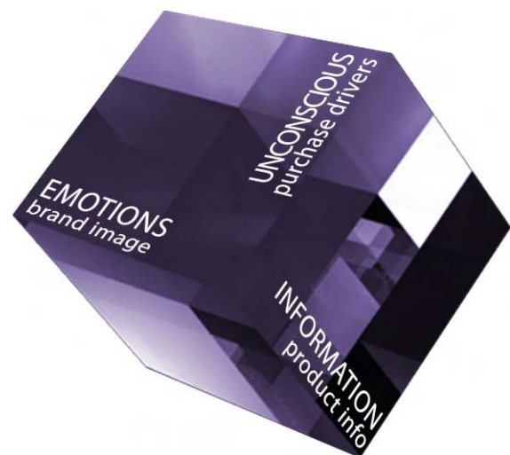
Fig. 1. Three dimensions of advertising: Information, Emotion, Unconscious

Many marketing theorists and practitioners have intuitively sensed the existence of the third dimension and its peripheral cues. Unfortunately they have been unable to capture them with traditional research methods. Why? Because the unconscious purchase drivers are likely to be encoded in neurophysiological processes which cannot be described in a paper-and-pencil questionnaire or an interview. Their detection requires advanced apparatus similar to machines used in medicine. I believe that the contemporary consumer research has reached the point to draw not only on marketing and humanities, but also on neuroscience and biology. What I am referring to is the biometric research approach. From this perspective, to assess an ad we need to look not only into respondents'